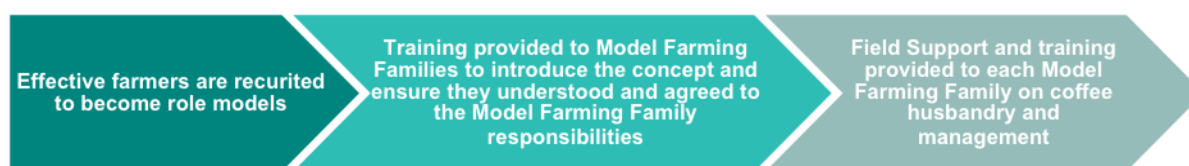
Figure 2 Model Farming Families process

Figure 2 shows the process for working with Model Farming Families.