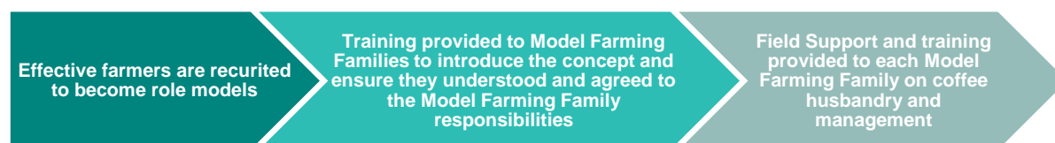
Figure 2 Model Farming Families process

Figure 2 shows the process for working with Model Farming Families.