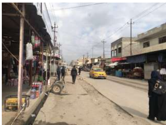
Photos taken during the Livelihood Rapid Market assessment data collection stage in West Mosul: